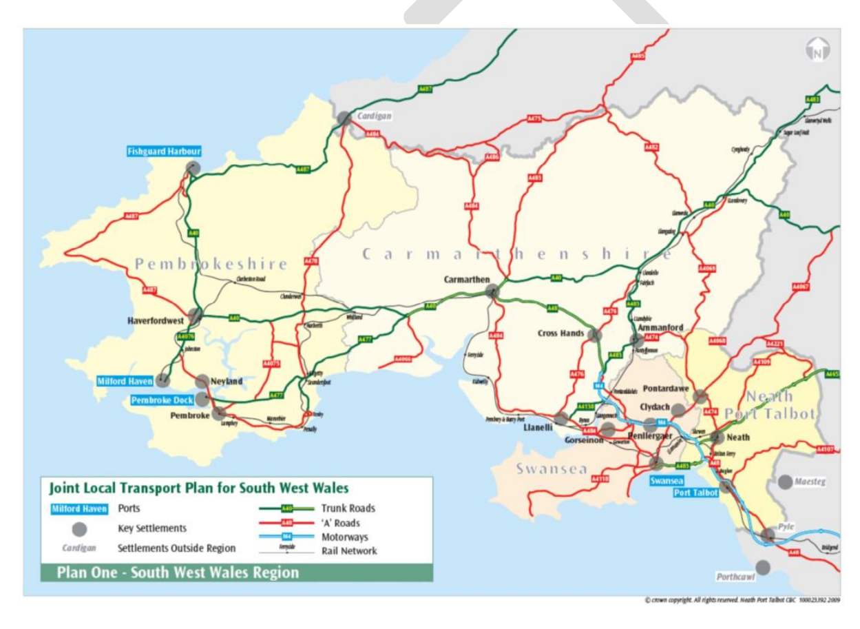
Figure 1 – Area Considered in the South West Wales Regional Transport Plan.